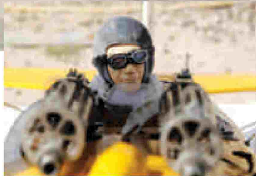
Great attention is given to every little detail on the scale model aeroplanes.