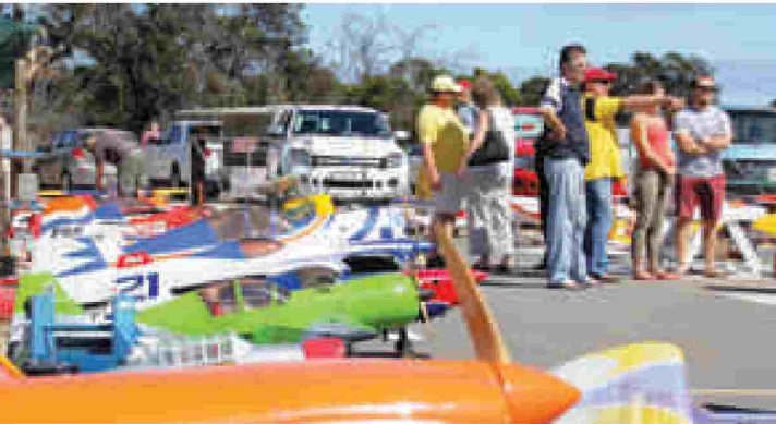
The family friendly event attracted many enthusiasts and spectators.